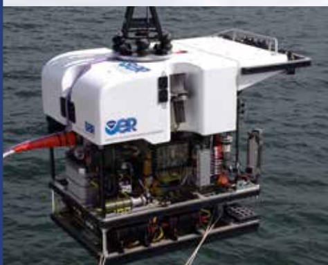
Top to bottom: The NOAA Ship Okeanos Explorer : America's Ship for Ocean Exploration; the control room onboard the Okeanos Explorer ; an octopus hiding; composite multibeam image of Tom's Canyon Complex; NOAA OER's new ROV, Deep Discoverer .